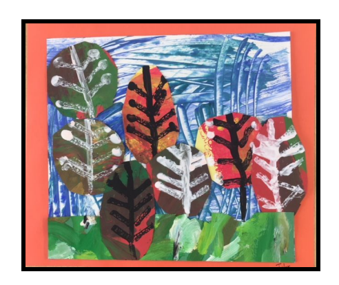
Tyler L, Grade 1