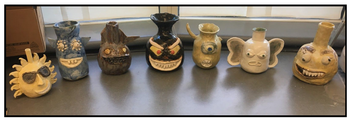
"Carolina Ugly Jugs" - Ridgefield High School Students Enter our October Gallery for more!